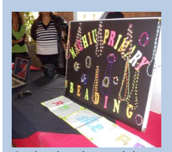
Bead work products made by learners at Machiu Primary School as part of their project

The focus in the projects was not on classroom activity and learning per se, but on improving the many social factors that impinge on education in South Africa.